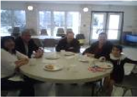
Parishioners enjoying the Pancakes