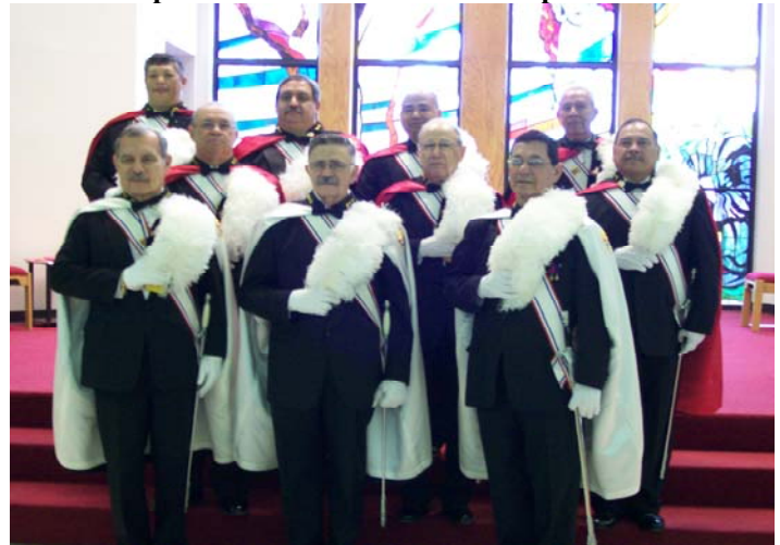
Sir Knights in Full Regalia