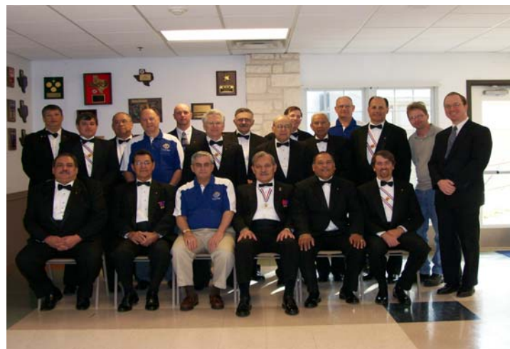
April Corporate Communion Group Photo